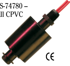
LS-74780 – All CPVC

Particularly well suited for rough service. Ideal for use in chemical and plating applications.