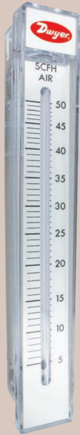
Model RMC 10" scale, 15-3/8" high

Polycarbonate, Gas Flow from 0.05-1800 SCFH, Water Flows to 10 GPM