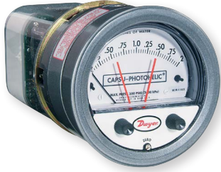
Series 43000 Capsu-Photohelic® Switch/Gage

Set points are instantly adjusted with front knobs.