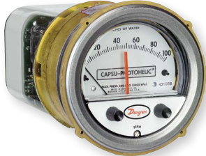
Series 43000 Capsu-Photohelic® Switch/Gage with Brass Body