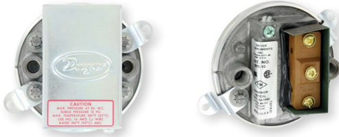
Series 1910 switch with conduit enclosure off. Shows electric switch and set point adjustment screw located on same side for easy installation.

Set Points from 0.07 to 20 in w.c. Repetitive Accuracy within 3%