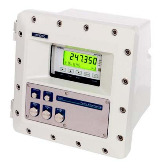
500 Series in Ex410 Enclosure