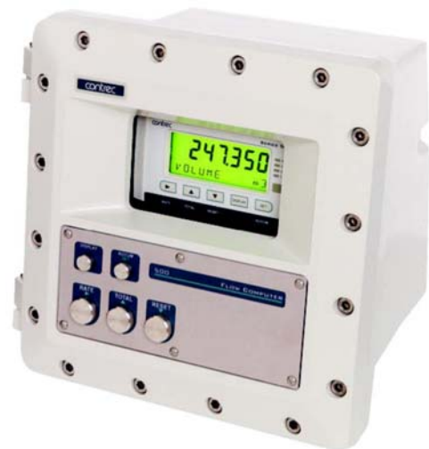
500 Series in Ex410 Enclosure